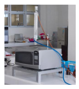
Figure 1. Modified microwave extractor

Microwave assisted extraction was conducted in a modified domestic microwave. The microwave was modified and equipped with extraction flask and a spiral condensor (Figure 1).